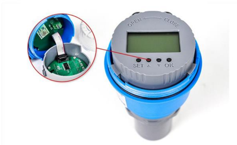
Good Quality Head Prob Design