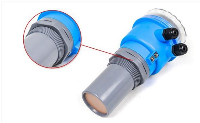
The Measuring Range 0-6 to 0-20 Meter